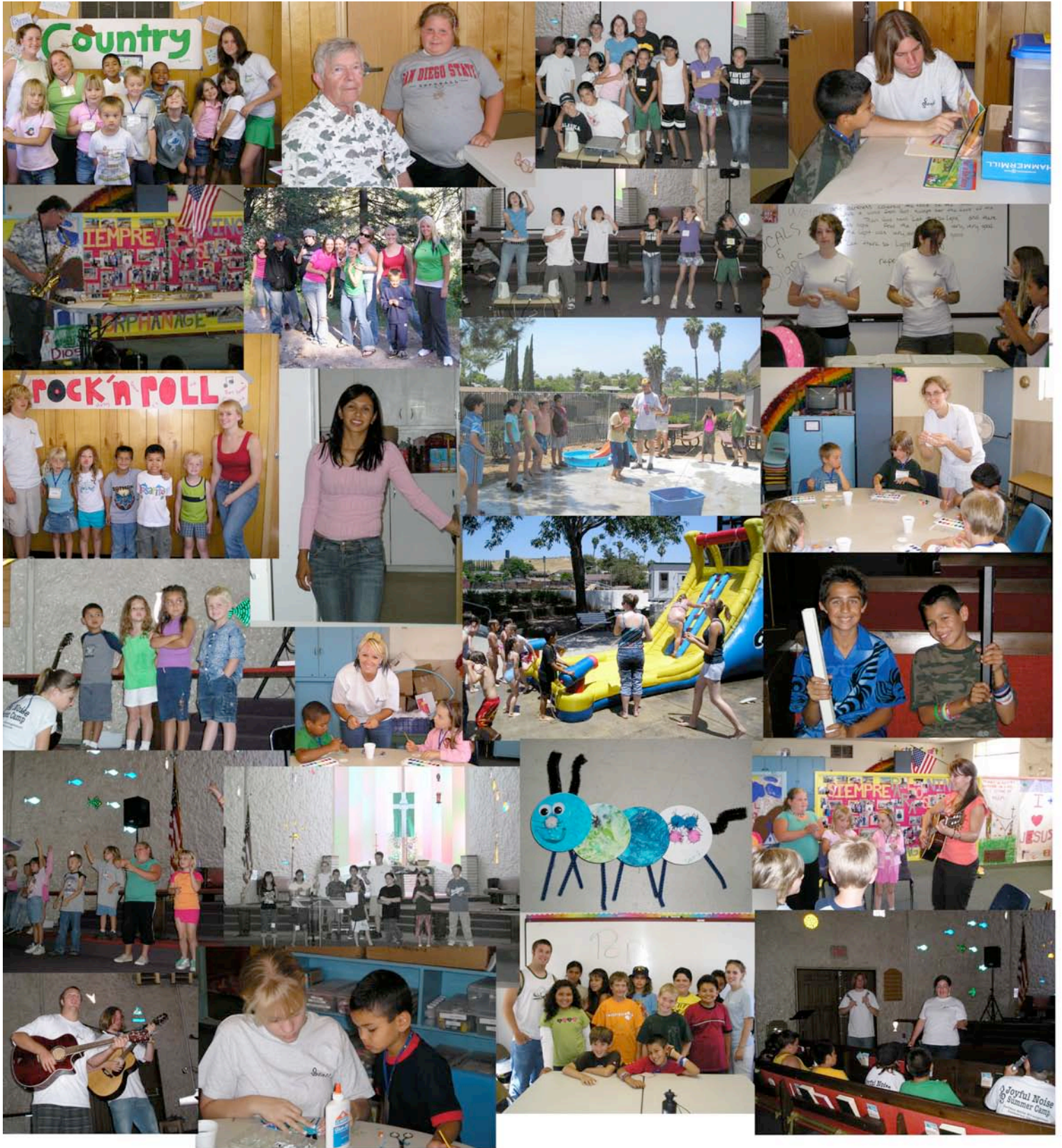
Joyful Noise Music School 2006