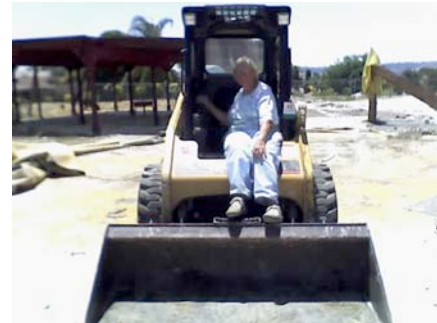
Getting the church ready for the Music Camp.